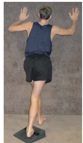
Medial calf/achilles stretch

Position the slant so that it is rotated 45 degrees counter-clockwise. Perform the soleus stretch shown above but this time step towards the left with your left foot. This should focus the stretch on the outside of the right achilles tendon (left). Next reposition the slant 45 degrees clockwise and step to the right with your left foot so as to stretch the inside of the right achilles tendon (right). To perform the stretch without a slant, move your right knee slowly to the right. This will stretch the inside of the right achilles. Next move your right knee slowly to the left. This will stretch the outside of the right achilles.