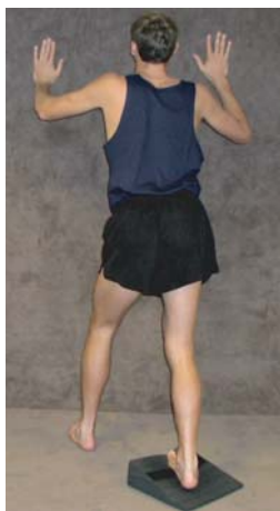
Lateral calf/achilles stretch

Slowly bend your right knee. You should feel the stretch in the lower portion of your calf.