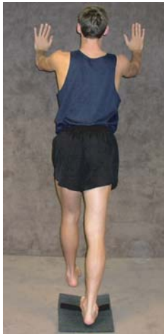
Gastrocnemius Stretch (above)

Position the slant 1-2 feet away from the wall depending on your height. Bend the knee closest to the wall and let your pelvis shift forward. Do not push against the wall. (As illustrated below, a wall is not necessary to perform this stretch but may be used to assist with balance.) The stretch should be felt on the leg furthest from the wall. Your heel should remain contact with the slant during the stretch. (This stretch can also be performed without the slant but the intensity will be less.)